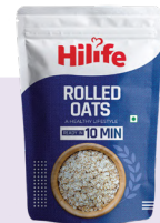
Rolled Oats POUCH 400GM

Experience the convenience and nourishment of Hilife Rolled Oats, ready in just 10 minutes. Crafted from premium whole grains, these oats offer a quick and delicious breakfast option that doesn't compromise on taste or nutrition. With their gentle rolling process, Hilife Rolled Oats maintain their rich fiber content and natural flavor, making them a versatile ingredient for both sweet and savory dishes. Whether you're starting your day with a warm bowl of oatmeal or adding a nutritious boost to your recipes, Hilife Rolled Oats are your go-to choice for simplicity and quality.