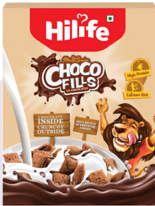
Choco Fills PKT 150GM