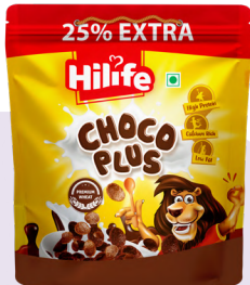
Choco Plus POUCH 1100GM