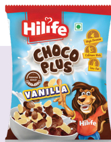
Choco Vanilla Scoop POUCH 22GM