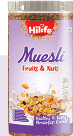
Muesli Fruits & Nuts JAR 300GM

Hilife Muesli Fruits and Nuts is a delightful blend of multi-baked grains, perfectly paired with an assortment of nutritious dried fruits and crunchy nuts. This thoughtfully crafted mix offers both flavor and nourishment, making it the ideal choice to kick-start your day. Begin your morning with a wholesome, delicious bowl of muesli that fuels your energy and satisfies your taste buds. Simple yet sensational, this breakfast cereal is sure to leave you craving more with every bite!