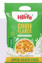
Sugarfree Cornflakes POUCH 300GM

At Hilife, we are dedicated to delivering exceptional taste and nutrition with the finest naturally sourced ingredients. Our Sugar-Free Cornflakes are crafted from carefully selected golden corn, ensuring each fiber-rich flake is packed with essential nutrients. Steamed, roasted, and expertly packed, these crunchy flakes are as delightful as they are wholesome. Enjoy a breakfast that not only delicious but also supports your health goals by maintaining a balanced glycemic index, helping you manage blood sugar levels while savoring every bite.