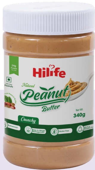
Natural Crunchy Peanut Butter JAR 340GM