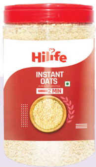
Instant Oats JAR 950GM