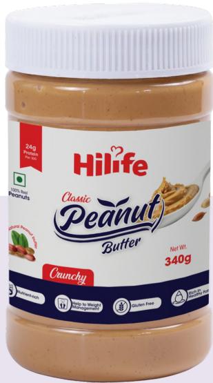
Classic Crunchy Peanut Butter JAR 340GM