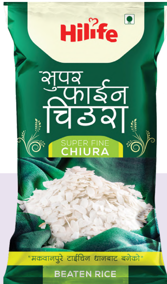
Superfine Chiura POUCH 1KG