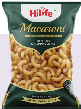
Pasta Macaroni POUCH 350GM

Discover the ultimate comfort food with Hilife Macaroni, crafted from high-quality durum wheat for a perfect bite every time. Whether you're whipping up a classic mac 'n' cheese, a creamy pasta bake, or a vibrant pasta salad, our macaroni provides the ideal base for a variety of delicious dishes. Its smooth, curved shape is designed to hold onto sauces and seasonings, delivering a satisfying taste and texture in every mouthful. Elevate your meals with Hilife Macaroni—where simplicity meets excellence.