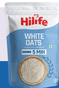
White Oats POUCH 400GM

Discover the simplicity and versatility of Hilife White Oats, the ideal choice for a nourishing breakfast or a wholesome addition to your favorite recipes. Our oats are expertly crafted from premium grains and enriched with essential nutrients, including dietary fiber and antioxidants. Perfectly balanced with corn grits, malt extract, and soya lecithin, Hilife White Oats provide a smooth texture and a mild flavor that seamlessly blends into both sweet and savory dishes. Elevate your daily meals with this versatile ingredient that supports a balanced and healthy lifestyle.