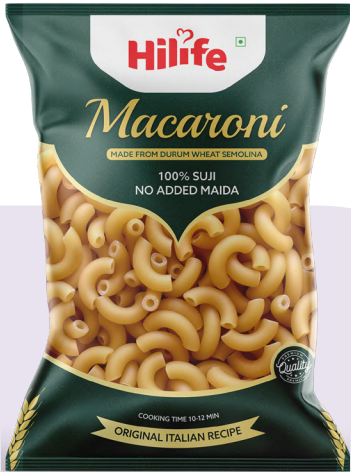
Pasta Macaroni POUCH 750GM