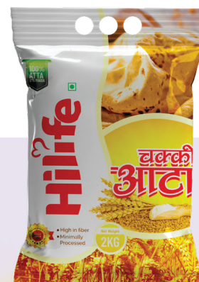
Chakki Aata POUCH 2KG

Hilife Chakki Atta is meticulously crafted from 100% whole wheat, offering you pure, nutrient-dense flour with no added maida. This freshly ground atta brings unparalleled softness and fluffiness to your rotis, making every meal a delightful experience. Perfect for a range of traditional dishes, it combines health and taste, infusing your cooking with the wholesome richness of whole wheat. Elevate your meals with Hilife Chakki Atta for a healthier, more flavorful dining experience.