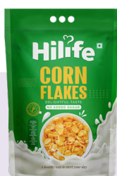
Sugarfree Cornflakes POUCH 450GM