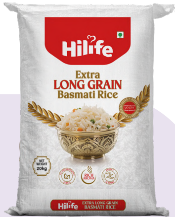
Extra Long Grain Basmati Rice SACK 20KG