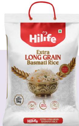
Extra Long Grain Basmati Rice POUCH 5KG