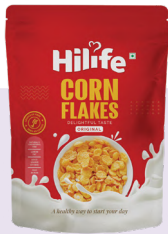
Cornflakes Original POUCH 500GM