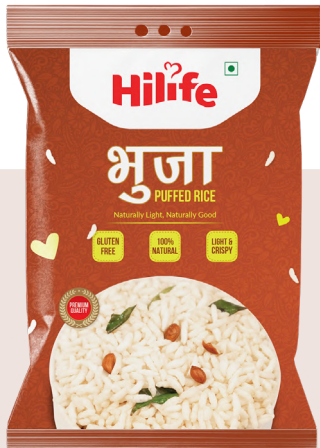
Puffed Rice POUCH 400 GM

Premium whole-grain puffed rice, naturally light and crisp, delivering pure energy for your daily boost.