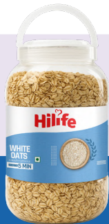
White Oats JAR 2KG