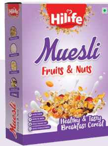
Muesli Fruits & Nuts PKT 400GM