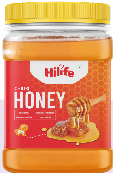
Chiuri Honey JAR 1KG