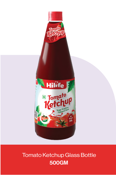
Tomato Ketchup Glass Bottle 500GM