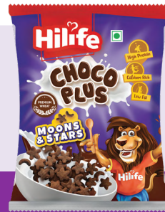
Choco Moons And Stars POUCH 15GM