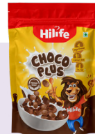
Choco Plus POUCH 450VGM