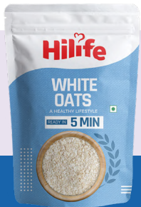
White Oats POUCH 800GM