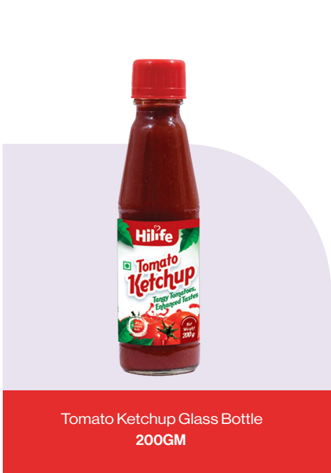
Tomato Ketchup Glass Bottle 200GM

Hilife Tomato Ketchup is a rich, flavorful condiment made from premium-quality ripe tomatoes, blended with just the right mix of spices for a balanced sweet and tangy taste. Smooth in texture and vibrant in flavor, it enhances everything from fries and burgers to sandwiches, noodles, and snacks. Whether you’re using it as a dip, a spread, or an ingredient in cooking, Hilife Tomato Ketchup brings a burst of deliciousness to every bite. No artificial flavors—just real tomato goodness in every squeeze.