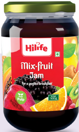
Mixed Fruit Jam Glass Bottle 500GM

Made from a delicious blend of ripe, juicy fruits—our Mix Fruits Jam brings sweet joy to every bite. Perfect for your morning toast or any time treat!