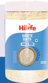
White Oats JAR 950GM