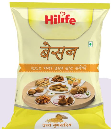
Chana Dal Flour Besan POUCH 500GM