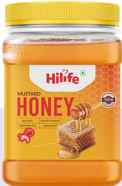
Mustard Honey JAR 1KG