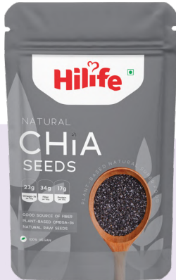
Chia Seeds POUCH 500GM