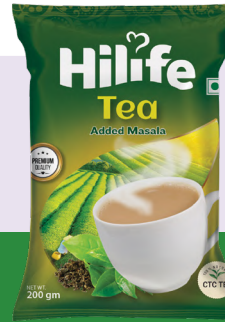
Masala Tea POUCH 200GM