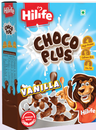
Choco Vanilla Scoop PKT 300GM