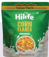
Sugarfree Cornflakes POUCH 1100GM