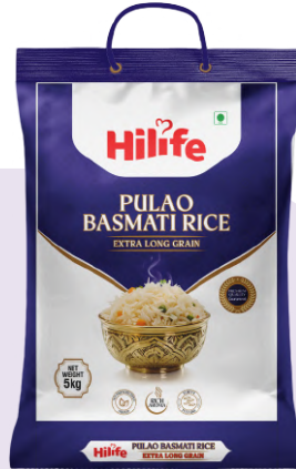
Pulao Basmati Rice POUCH 5KG