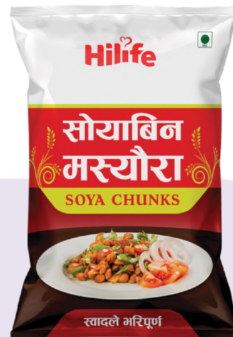
Soyabean Masyaura POUCH 200GM

Fuel your meals with the plant-based power of Hilife Soya Chunks. Made from premium quality soybeans, these protein-rich chunks are a perfect meat alternative for vegetarians and fitness enthusiasts alike. Packed with essential amino acids, iron, and dietary fiber, Hilife Soya Chunks support muscle growth, aid digestion, and contribute to overall wellness. Their soft, juicy texture and ability to absorb flavors make them ideal for curries, stir-fries, pulao, and snacks. Low in fat and cholesterol-free, Hilife Soya Chunks are a smart, nutritious choice for wholesome everyday cooking.