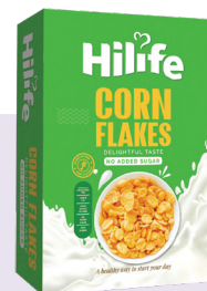
Sugarfree Cornflakes PKT 300GM