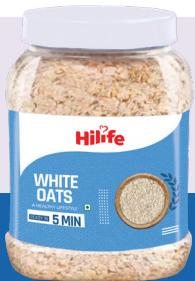
White Oats JAR 500GM