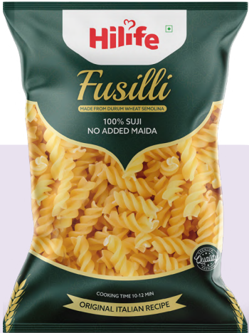
Pasta Fusilli POUCH 750GM