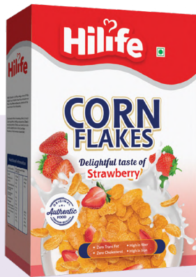
Strawberry Cornflakes PKT 300GM