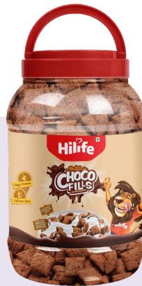
Choco Plus JAR 500GM