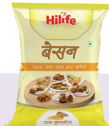
Chana Dal Flour Besan POUCH 200GM

Experience the wholesome goodness of Hilife Chana Dal. Sourced from premium quality chickpeas, this dal is a nutritious and flavorful addition to your meals. Rich in protein and dietary fiber, it supports a healthy diet while enhancing your dishes with its delightful taste and texture. Whether you're preparing a traditional dal recipe, soups, or savory snacks, Hilife Chana Dal brings consistent quality and natural flavor to every bite. Low in fat and packed with essential nutrients like iron and potassium, it's the perfect choice for a balanced, heart-healthy lifestyle. Add Hilife Chana Dal to your pantry and elevate your everyday cooking with purity you can trust.