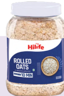
Rolled Oats JAR 450GM