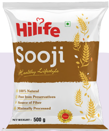
Sooji POUCH 500GM