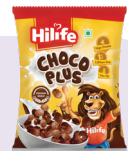
Choco Plus POUCH 15GM