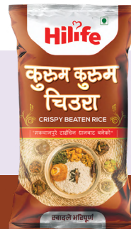
Kurum Kurum Chiura POUCH 450GM

Elevate your snacking with Hilife's Kurum Kurum Chiura the ultimate premium beaten rice, crafted from the finest Makwanpure Paddy. Our high-quality beaten rice offers a delightful crunch and light texture that transforms every bite into a satisfying experience. Meticulously prepared for freshness and flavor, Hilife Beaten Rice is perfect for a quick snack or as a versatile ingredient in your favorite recipes. Enjoy the premium quality and delicious crunch that sets Hilife apart.