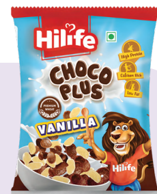
Choco Vanilla Scoop POUCH 15GM