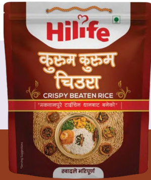
Kurum Kurum Chiura POUCH 3KG