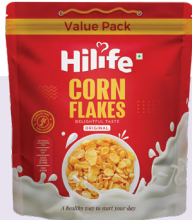
Cornflakes Original POUCH 1100GM