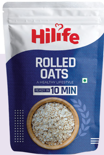
Rolled Oats POUCH 800GM