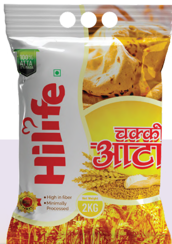
Chakki Aata POUCH 5KG