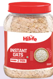
Instant Oats JAR 450GM