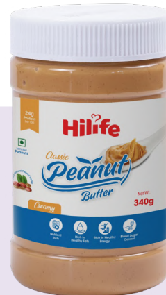
Classic Creamy Peanut Butter JAR 340GM