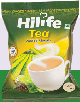
Masala Tea POUCH 500GM