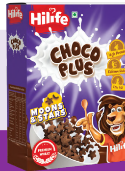
Choco Moons And Stars PKT 300GM