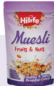
Muesli Fruits & Nuts POUCH 300GM