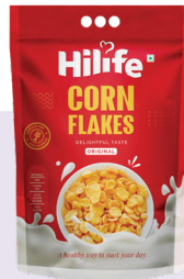
Cornflakes Original POUCH 450GM