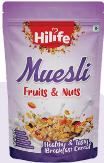
Muesli Fruits & Nuts POUCH 700GM