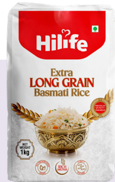
Extra Long Grain Basmati Rice POUCH 1KG