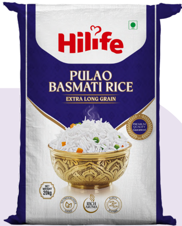
Pulao Basmati Rice SACK 20KG