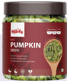
Pumpkin Seeds JAR 350GM