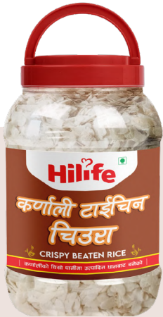
Hilife Karnali Taichin Chiura JAR 1700GM