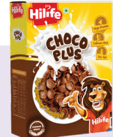
Choco Plus PKT 300GM