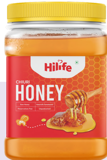
Chiuri Honey JAR 500GM

Hilife Chiuri Honey is a unique natural honey collected from Chiuri tree flowers in Nepal's wild forests. This amazing honey has a sweet floral taste with a smooth texture that feels great in your mouth. Full of natural goodness and healthy nutrients, this pure honey brings the power of nature directly to your family. Perfect for adding sweetness to your tea, spreading on bread, or eating straight from the jar - this golden honey creates a perfect sweet experience every time. Pure, natural, and absolutely delicious, HiLife Chiuri Honey gives you nature's finest sweetness in every spoonful!