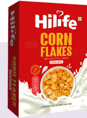
Cornflakes Original PKT 300GM