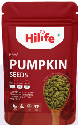
Pumpkin SeedsPOUCH 500GM