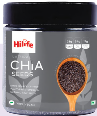
Chia Seeds JAR 350GM