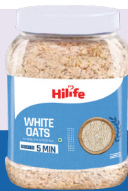
White Oats JAR 450GM