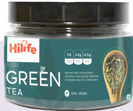
Green Tea JAR 75GM

Hilife Pure Green Tea is a revitalizing blend, rich in antioxidants and brimming with health benefits. Sourced from the finest tea leaves, this pure and refreshing beverage is perfect for starting your day with a natural energy boost or unwinding in the evening. Whether you're looking to enhance your wellness routine or simply enjoy a soothing cup of tea, Hilife Pure Green Tea offers the perfect balance of flavor and goodness. Sip your way to better health with every cup.