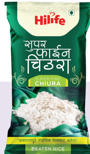
Superfine Chiura POUCH 450GM

Discover the wholesome goodness of Hilife Super Fine Chiura – a premium quality beaten rice made from the finest Makwanpure paddy. Light, crisp, and easy to digest, this nutrient-rich chiura is a smart choice for your daily meals. Packed with essential nutrients, it's low in gluten, helps maintain blood sugar levels, and supports overall well-being. Whether paired with curries or enjoyed as a snack, Hilife Super Fine Chiura delivers purity, taste, and the perfect crunch in every bite.