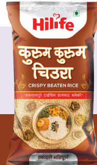
Kurum Kurum Chiura POUCH 1KG