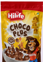
Choco Plus POUCH 200GM