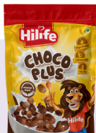
Choco Plus POUCH 100GM