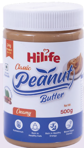
Classic Creamy Peanut Butter JAR 500GM