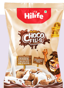
Choco Plus POUCH 26GM

Enjoy little bites of happiness with HiLife Choco Fills that are crunchy on the outside and chocolaty inside! Think of crispy cereal pieces filled with healthy grains, each one hiding smooth chocolate that melts in your mouth. These tasty HiLife Choco Fills will make your mornings better, help during study time, and turn snack breaks into something special! Try it, love it, and make every moment sweeter!