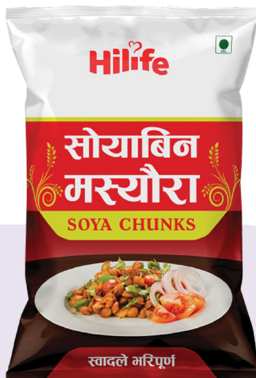
Soyabean Masyaura POUCH 200GM