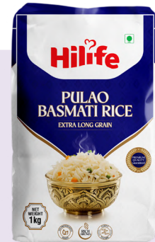
Pulao Basmati Rice POUCH 1KG

HiLife Pulao Basmati Rice features delicately long grains with a subtle, buttery aroma, perfectly crafted to absorb spices and create light, fluffy pulao dishes. This premium basmati rice is specially selected for its ability to soak up rich flavors while maintaining perfect texture and grain separation. The natural buttery fragrance enhances every spice you add, making your pulao dishes restaurant-quality every time. Perfect for special occasions or family meals, HiLife Pulao Basmati Rice makes every pulao dish a memorable culinary experience!