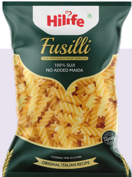
Pasta Fusilli POUCH 350GM

Elevate your pasta dishes with Hilife Fusilli Pasta, crafted to deliver a delightful twist on your favorite recipes. Made from premium durum wheat, this pasta features the classic corkscrew shape, perfect for holding onto rich sauces and dressings. Whether you're preparing a hearty Italian feast, a fresh pasta salad, or a quick weeknight dinner, Hilife Fusilli Pasta brings exceptional texture and taste to every bite. Enjoy a satisfying and versatile ingredient that's as easy to cook as it is to savor.