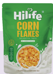
Sugarfree Cornflakes POUCH 500GM