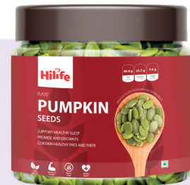
Pumpkin Seeds JAR 200GM