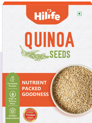
Quinoa Seeds PKT 400GM