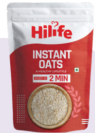
Instant Oats POUCH 400GM

Hilife Instant Oats are a powerhouse of natural nutrition, brimming with proteins, essential vitamins, minerals, and antioxidants. These oats stand out for their high fiber content, surpassing other grains in promoting digestive health. Crafted for your convenience, Hilife Instant Oats come in a delightful blend of multigrain granules, offering a quick and wholesome breakfast option. Enjoy the rich, healthy goodness of Hilife Instant Oats—your perfect start to a nutritious day.