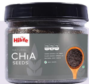
Chia Seeds JAR 200GM