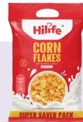
Cornflakes Original POUCH 300GM

Discover Hilife's commitment to exceptional taste and nutrition with our Cornflakes Original. Made from meticulously selected golden corn, each fiber-rich flake is packed with essential nutrients. Steamed, roasted, and perfectly packed, these crunchy flakes offer a delightful breakfast experience that's as delicious as it is wholesome. Not only do they provide a satisfying start to your day, but they're also an excellent source of fiber, supporting heart health and promoting digestive wellness. Enjoy the perfect balance of taste and nutrition with every bowl!