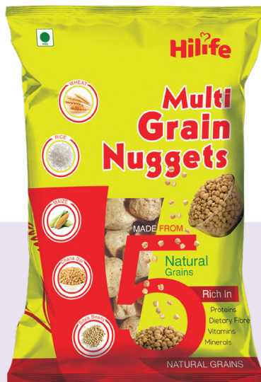
MultiGrain Nuggets POUCH 200GM