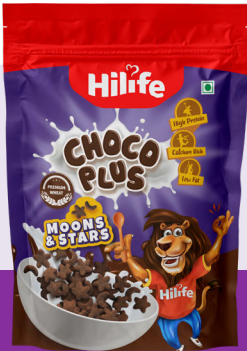
Choco Moons And Stars POUCH 450GM