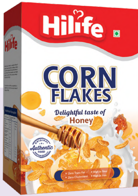
Honey Cornflakes PKT 300GM