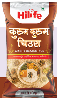
Kurum Kurum Chiura POUCH 700GM