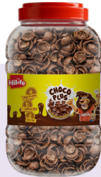
Choco Plus JAR 7500GM