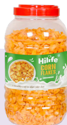
Sugarfree Cornflakes JAR 800GM