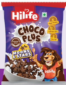
Choco Moons And Stars POUCH 22GM