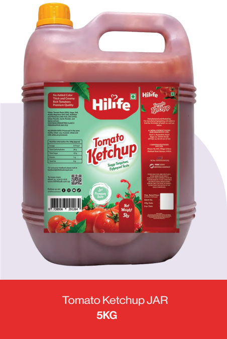
Tomato Ketchup JAR 5KG