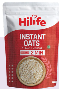
Instant Oats POUCH 800GM