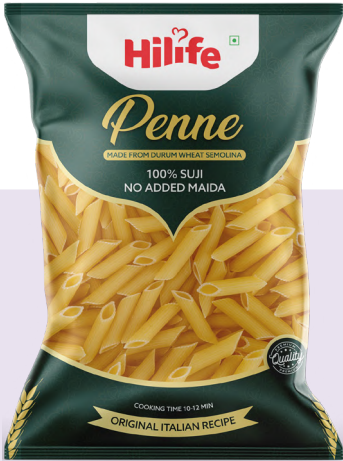
Pasta Penne POUCH 750GM