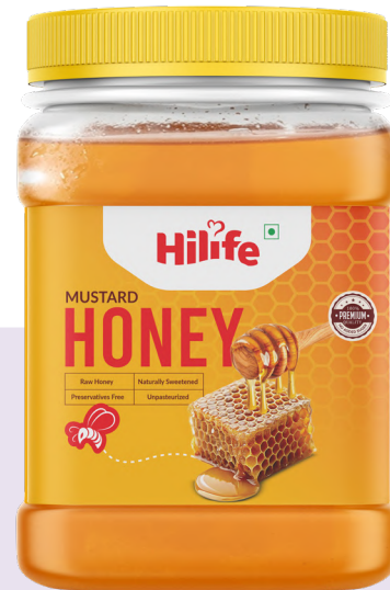
Mustard Honey JAR 500GM

Hilife Mustard Honey is a quality natural honey gathered from mustard flower fields in Nepal. This beautiful golden honey offers a soft, sweet flavor with a silky smooth texture. Loaded with natural nutrients and health benefits, this authentic honey brings countryside freshness to your daily meals. Excellent for tea, pancakes, or enjoying alone - this honey creates sweet happiness in every bite. Clean, natural, and genuinely tasty, Hilife Mustard Honey provides nature's finest sweetness drop by drop!