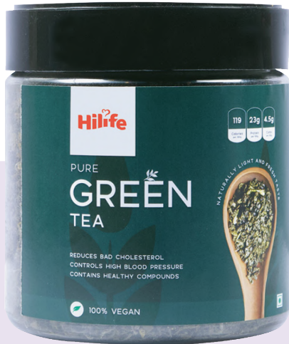
Green Tea JAR 120GM